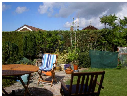
16 hours later after pump out

Double glaze glass panes are separated by a hollow extruded spacer bar filled with a desiccant and glued/sealed in position. The desiccant removes any residual moisture in the air/gas space between the panes during manufacture. If the peripheral seal is imperfect during manufacture or breached by a later seal leak, it may not be detected until a considerable time has passed, possibly years. Argon gas is sometimes used as a space filler to reduce the transmission of heat between the panes. A vacuum is not used as this would bend the glass and would eventually be lost as air diffuses through the sealant.