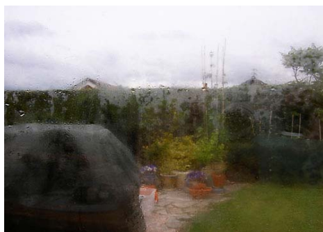
Moisture Before pump out

This article gives the reasons and a method of removing accumulated moisture from double glazed windows, large or small. Cost to have window replaced quoted at £525. Cost of materials to repair < £15.