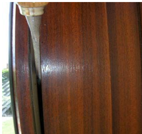
Cross Section of a Conservatory Door